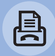
SUPER G3 FAX (SCX-4216F only)